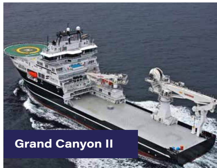
Grand Canyon II