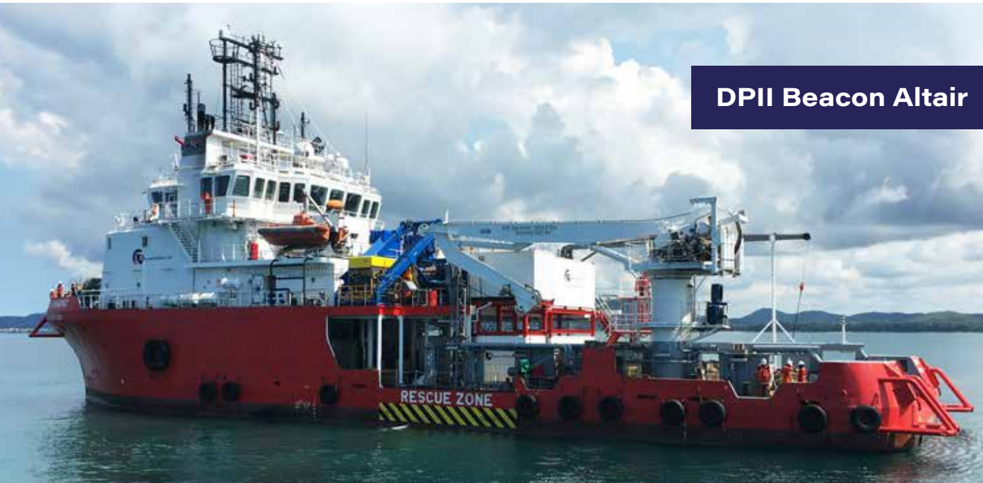
DPII Beacon Altair