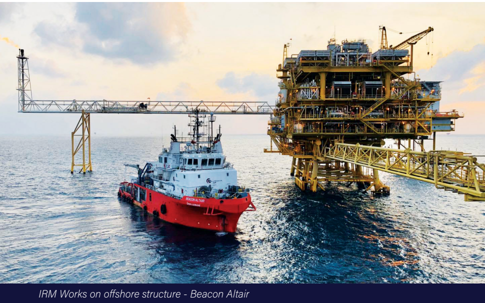
IRM Works on offshore structure - Beacon Altair

Beacon Offshore Ltd. has a proven international track record. Our subsea operations are executed by a dedicated professional work force, sophisticated assets, and a quality process built on years of offshore experience. These processes are being constantly developed based on a lessons learned philosophy.