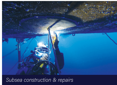
Subsea construction & repairs

Light construction support from own or chartered vessels using robotics or diver intervention techniques. Flexible modular WROV and DIVE systems can be mobilized onto client vessels or offshore structures to provide operations independent from 3rd party vessels and to minimize weather disruption.