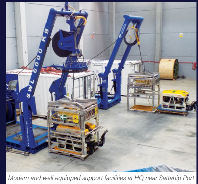
Modern and well equipped support facilities at HQ near Sattahip Port